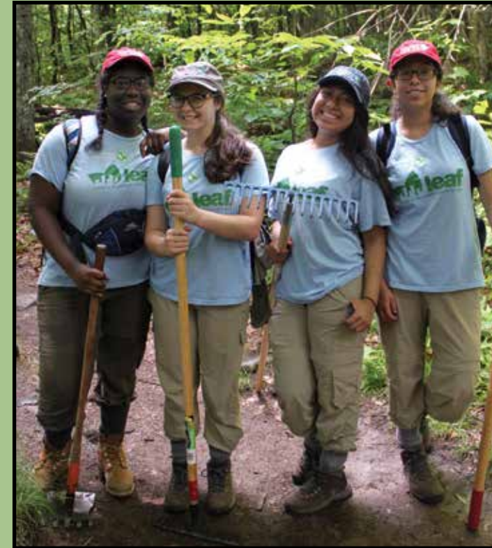
Leaders in Environmental Action for the Future (LEAF) interns take a break from trail work in the Green Hills

In the early 1900s, the Green Hills raged with wildfires, kindled by logging slash piles and sparks from timber trains. The fires helped to sustain a rare natural community known as "red pine rocky ridge," a hardy habitat adapted to fire, drought, wind and winter ice. You'll see some of this 700-acre community (the largest in the state) atop Middle and Peaked mountains. Look for even-aged stands of red pine (seeded during the fires) with a sparse, glade-like understory.