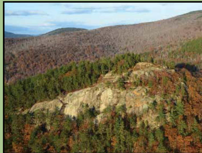
Green Hills Preserve from the air